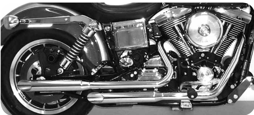
K11063 1-3/4" SIDE SLASH CUT EXHAUST SET FOR DYNA GLIDES 1991-2003... w/S-BEND REAR PIPE