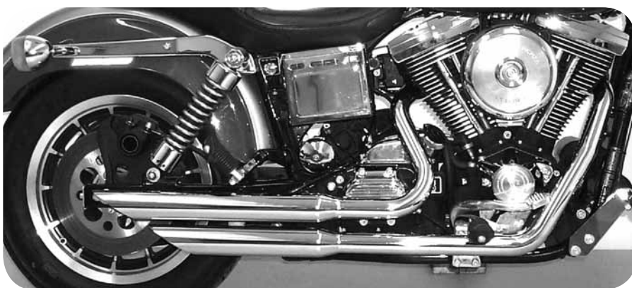
K11062 1-3/4" BOTTOM SLASH CUT EXHAUST SET FOR DYNA GLIDES 1991-2003... w/S-BEND REAR PIPE