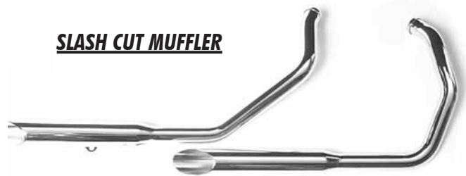
SLASH CUT MUFFLER