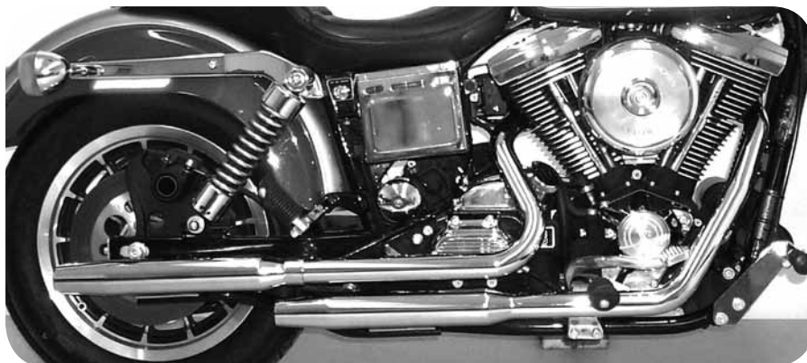
K11061 1-3/4" TAPERED MUFFLER EXHAUST SET FOR DYNA GLIDES 1991-2003... w/S-BEND REAR PIPE