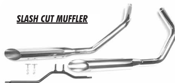
SLASH CUT MUFFLER