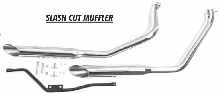
SLASH CUT MUFFLER

K11017 1-3/4" SLASH CUT MUFFLER EXHAUST SET FITS SHOVELHEAD 1970-84 FL/FLH (KICK or ELECTRIC) FEATURES OVER THE TRANSMISSION REAR PIPE WHICH CLEARS BIG BATTERY AND A FRONT PIPE THAT CLEARS STOCK FLOORBOARD MOUNTS