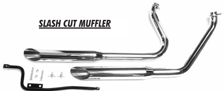
SLASH CUT MUFFLER

K11030 1-3/4" SLASH CUT MUFFLER EXHAUST SET FITS SHOVELHEAD 1970-84 FLH (ELECTRIC START) FEATURES UNDER THE TRANSMISSION REAR PIPE WHICH CLEARS LARGE FLH BATTERY & A FRONT PIPE WHICH CLEARS FACTORY FLOORBOARDS & FORWARD-MOUNTED MASTER CYLINDER